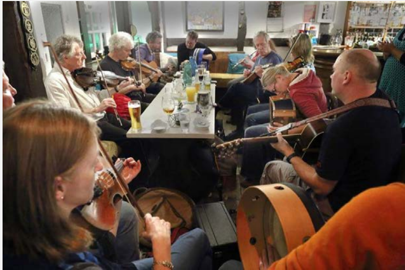
Session in Hastings as part of the CCÉ Hastings Fleadh weekend

fleadhanna and other occasions as it is getting harder to access all the space we need in the Haringey Irish Centre (which has been our "go to" place now for several years). We have also had to work hard to secure our meeting space in the Camden Irish Centre but hope that this should be able to continue.