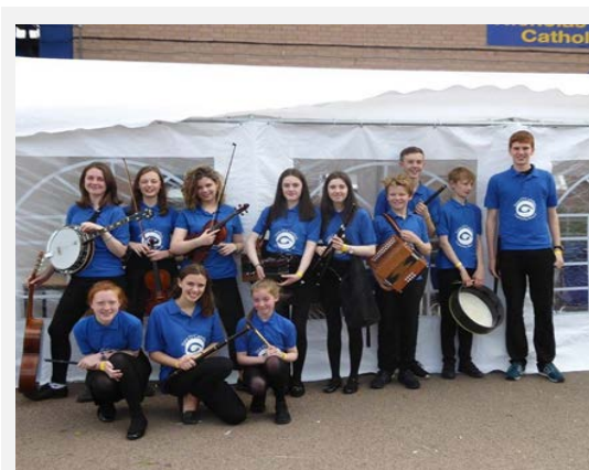
Tara O'Carolan Branch members in Ennis at Fleadh Cheoil na hÉireann