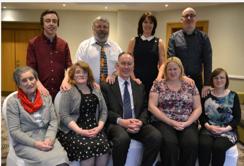
Member of the Provincial Council elected at Convention 2017