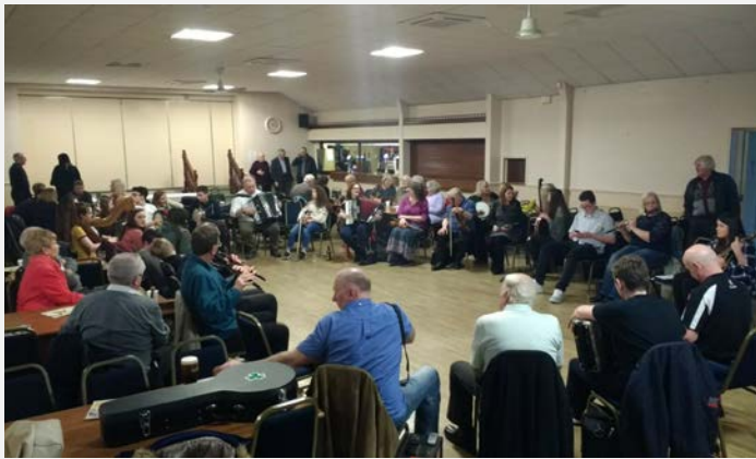
Leagrave Branch Session at St Joseph's Luton.

The all-Britain held at St Albans in June was another successful weekend, with a number of competitors qualifying for the all-Ireland; the all-Ireland itself was a damp but very enjoyable few days.