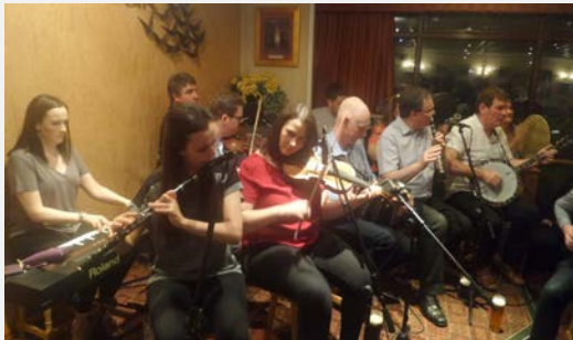
Musicians playing a session after the Northern Regional Fleadh, Leeds.