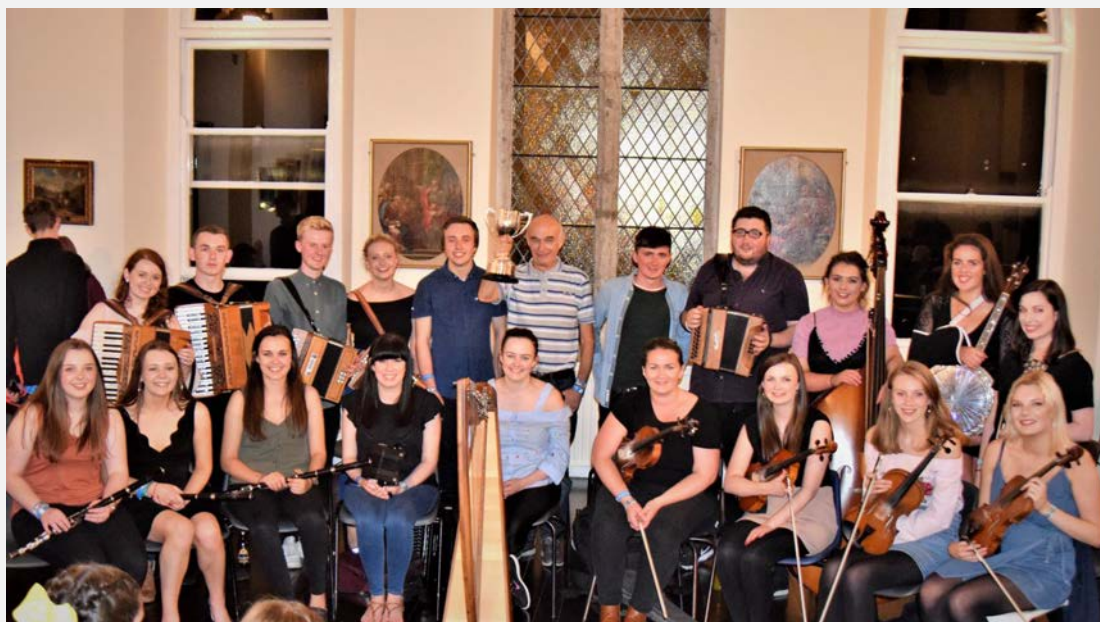
IrishMinstrel's CCÉ -Senior Grúpai Cheoil winners in Ennis 2017