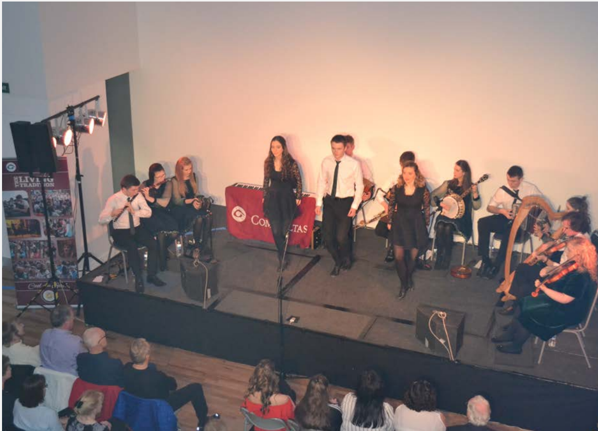
2017 Echoes of Erin group on stage during their tour of Britain

The region is also looking forward to the Echoes of Erin Concert tour 2018 Hosted by the Leamington branch on 22 nd February 2018 and the Midland Regional Fleadh 13 th May 2018 at Princethorpe College.