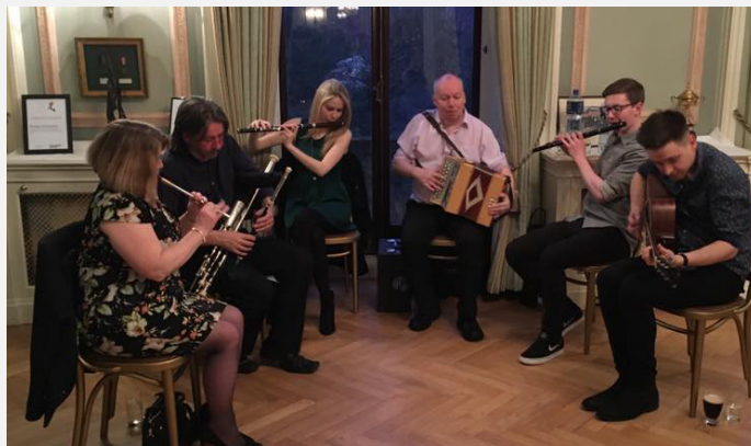
Musicians performing at the Embassy of Ireland in London

This year marked the 60th anniversary of both the East and West London branches. East London marked theirs with a fine and very well attended evening at the Crown Hotel in Cricklewood (and the craic was certainly good...). The parish hall in Quex Road Kilburn hosted the celebrations for West London (another location traditionally at the epicentre of Irish London). Both occasions brought together members old and new for some great music and reflected the true and enthusiastic groundswell of support for traditional Irish music in London (would be great to see that reflected at our fleadhanna, meetings and other Comhaltas occasions).