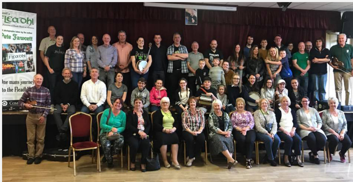
St Patrick's Branch with Liverpool Branch on their exchange visit from Coatbridge to Liverpool

December 2016 - There were several branch Christmas céilídh and parties held throughout the region in December, with Santa making a visit to each to hand out presents and sweets. In addition to the céilí/children's party held at St. Roch's, Irish Minstrel's CCÉ held their annual Christmas céilí in the Coupar Institute. This was well attended and was a very enjoyable night.